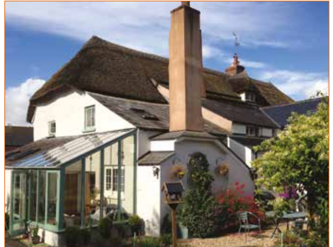
Chimney should terminate at least 1.8m above ridge height.

Fire Service personnel may need to consider how best to deal with thatch fires incorporating a fire barrier. The barrier must remain unbroken during firefighting operations.